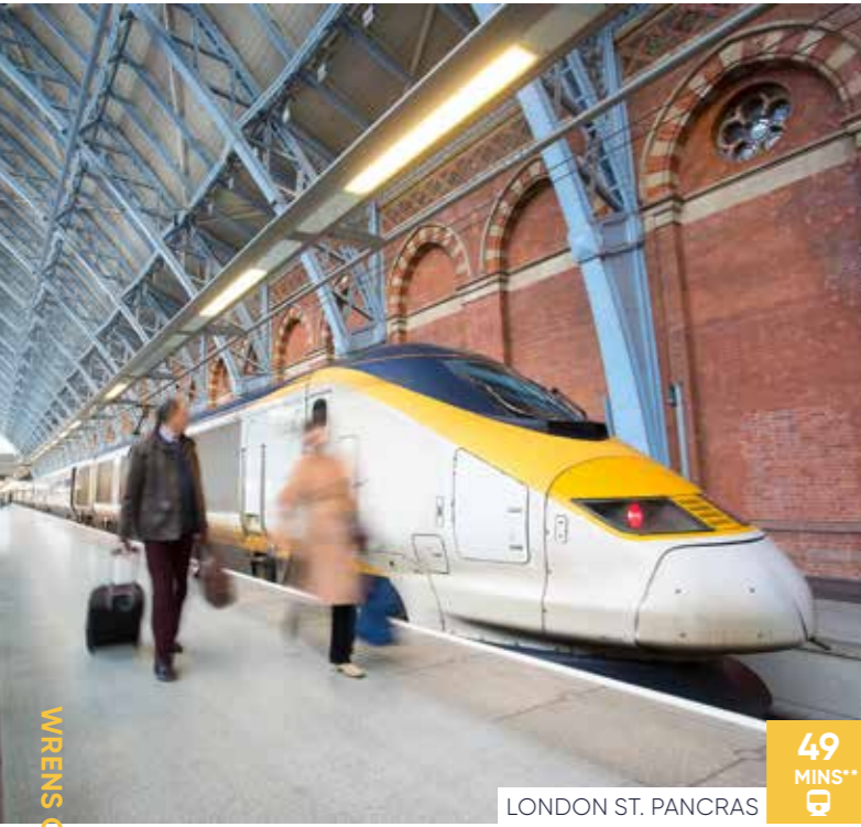
LONDON ST. PANCRAS